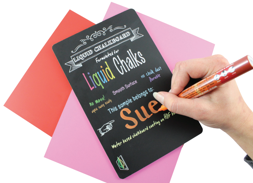
Digital Printing on Chalkboard

Colors shown are representative Please request a sample for accurate colors